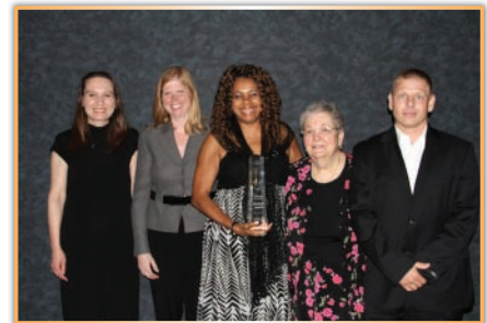
Property of the Year Victoria Plaza Burton Carol Management